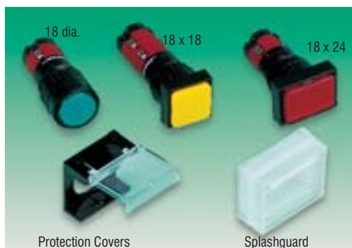
Indicator depth behind panel T1¼ lamp fitting 1 pole=35 T1¼ lamp fitting 2 pole=43 Indicator (non switchable)=38.3 Panel cut-out=16.0

Illuminated Push Buttons and Indicators - 5A 250V ac