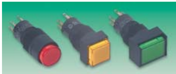
Round Bezel=14 dia. Square Bezel=14 x 14 Rectangular Bezel=14 x 18 Depth behind panel (inc. terminals)=26.5